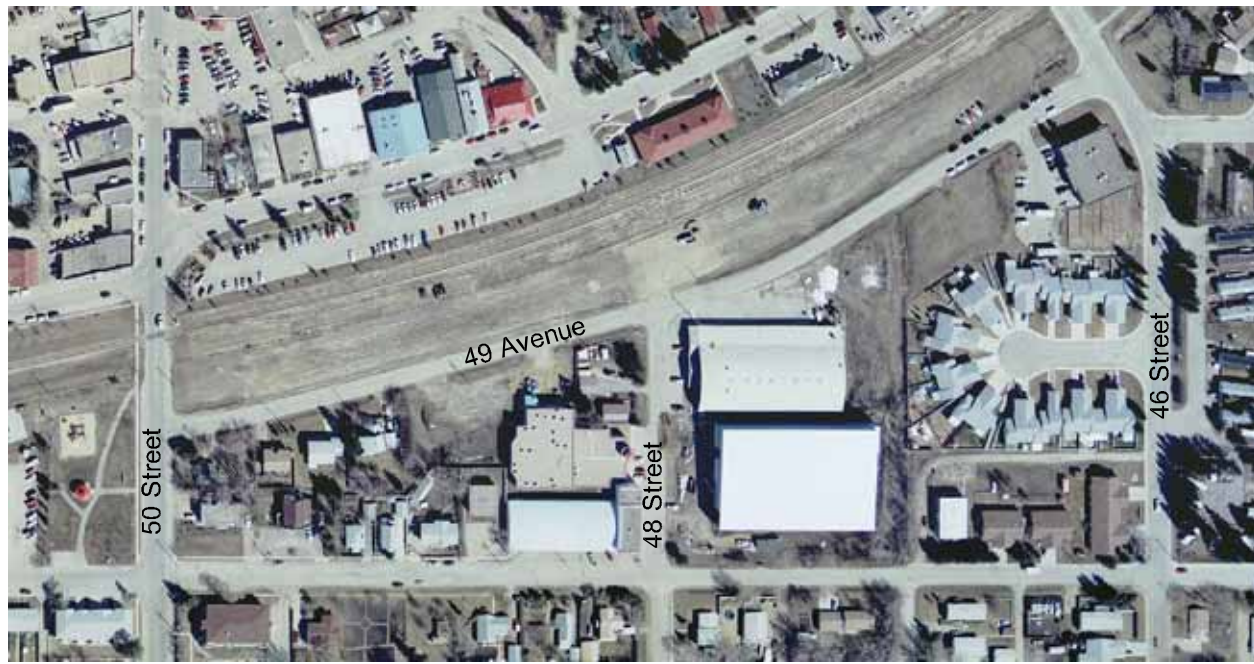
Existing Area South of Railway - Between 50 Street and 46 Street