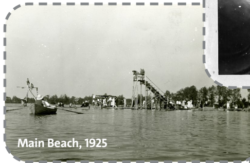
Main Beach, 1925