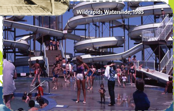
Wildrapids Waterslide, 1985

Wildrapids Waterslide, Photo: David Brunner