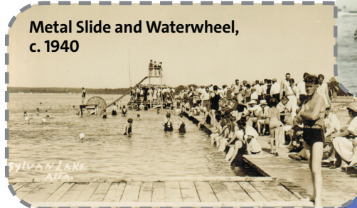
Metal Slide and Waterwheel, c. 1940