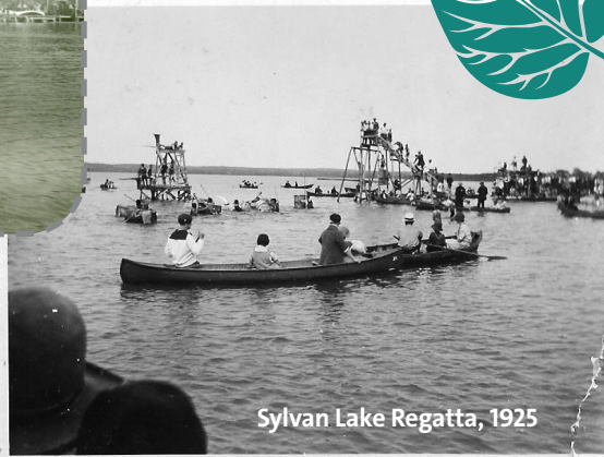
Sylvan Lake Regatta, 1925