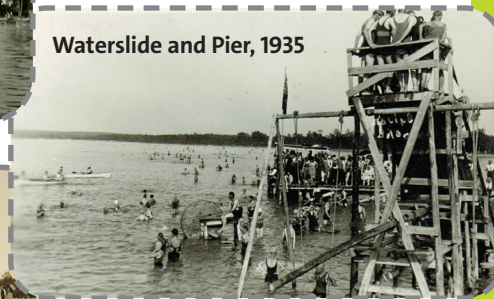
Waterslide and Pier, 1935