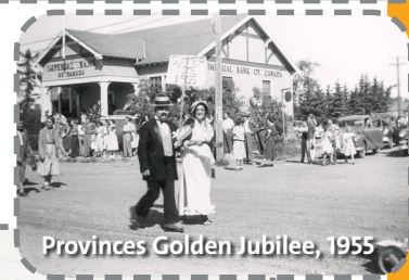
Provinces Golden Jubilee, 1955