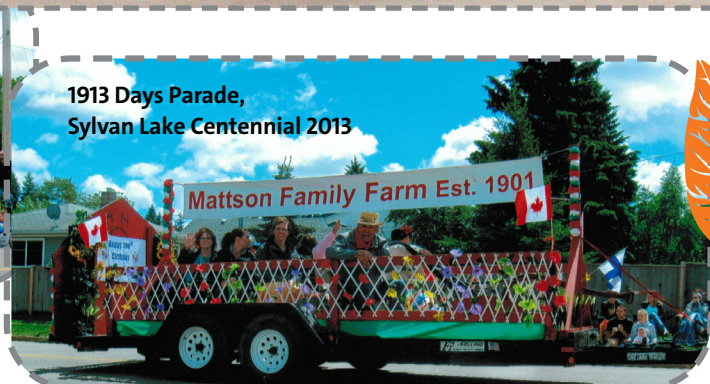
1913 Days Parade, Sylvan Lake Centennial 2013