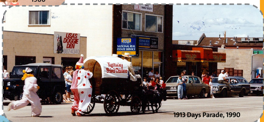
1913 Days Parade, 1990