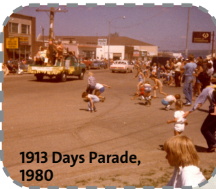
1913 Days Parade, 1980