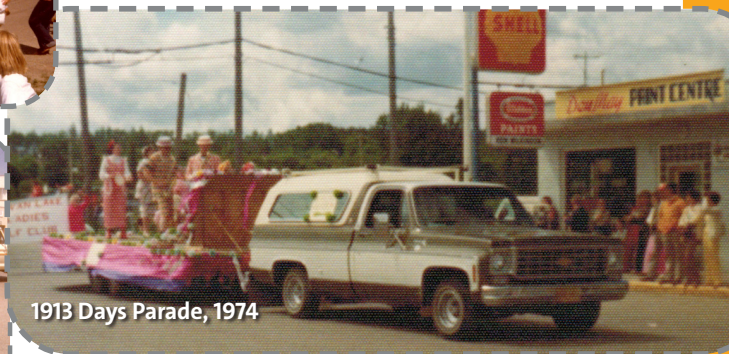
1913 Days Parade, 1974