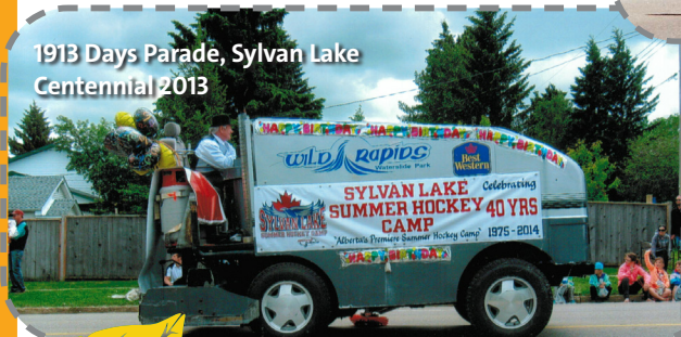
1913 Days Parade, Sylvan Lake Centennial 2013