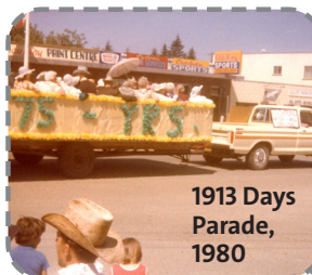
1913 Days Parade, 1980