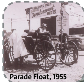
Parade Float, 1955