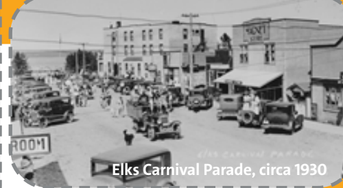
Elks Carnival Parade, circa 1930