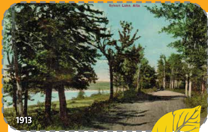
Coloured postcard of trees lining both sides of the dirt road running along the lakefront. Postcard published by Sylvan Lake Trading Company. c. 1913