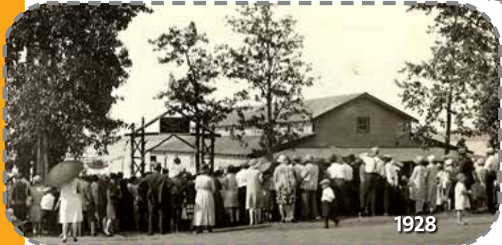
A crowd gathered at the Boathouse on the opening of the new pier on July 12, 1928.