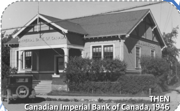
THEN Canadian Imperial Bank of Canada, 1946