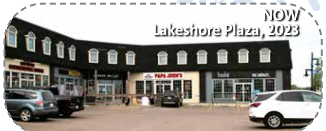
NOW Lakeshore Plaza, 2023