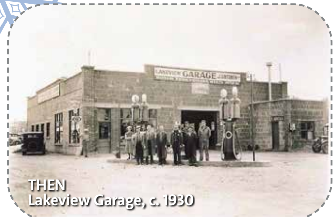
THEN Lakeview Garage, c. 1930