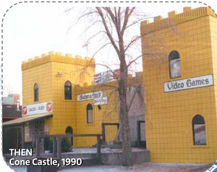
THEN Cone Castle, 1990