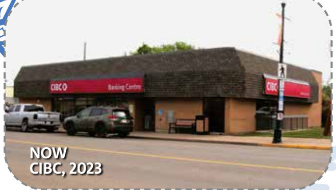
NOW CIBC, 2023