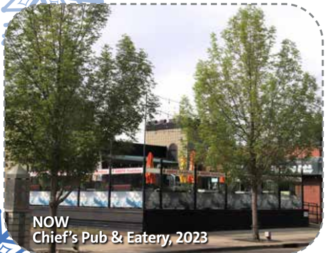
NOW Chief's Pub & Eatery, 2023