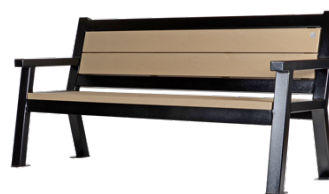
d) Lakeshore Drive Park Bench