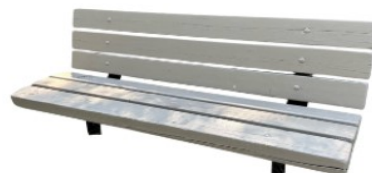
b) Trails & Parks Bench