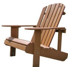
c) Lakeshore Drive Adirondack Chair